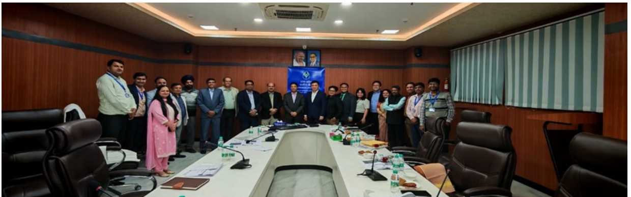
Visit to Uttar Pradesh Gramin Bank, Lucknow